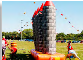
It's a Knockout

We're looking for teams of 8-10 to take part in the It's a Knockout – either let us match you up with a team or get together with friends and family to create your own. This one does need to be booked in advance so we can get the teams organised ahead of the big day – so please let us know by Friday 29th April 2022.